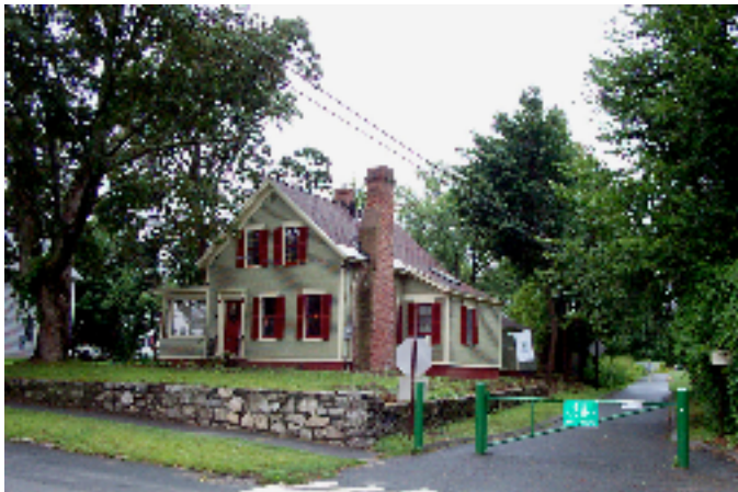
Living life along a rail trail in Florence, MA.